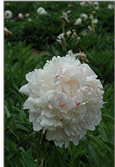
Chestine Gowdy Peony flowers