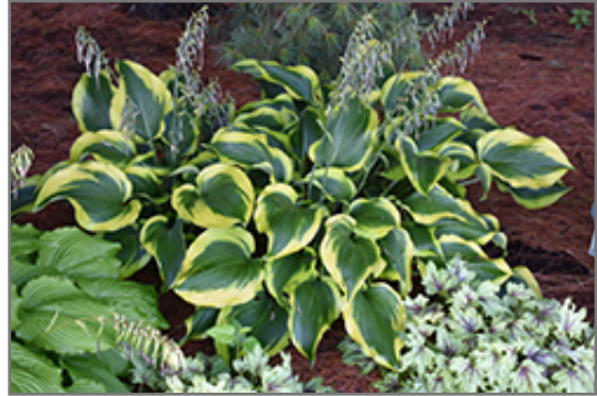
Atlantis Hosta

Atlantis Hosta is recommended for the following landscape applications;