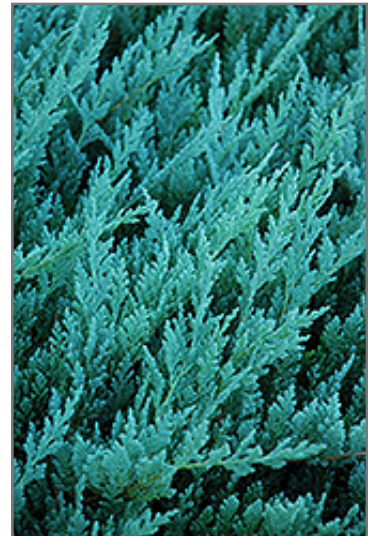
Blue Chip Juniper foliage