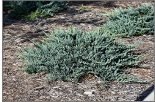
Blue Chip Juniper