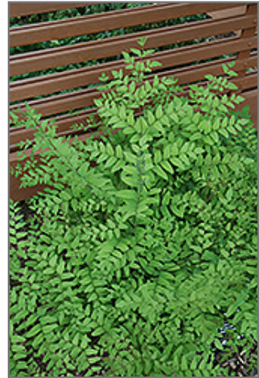
Purpleleaf Royal Fern foliage