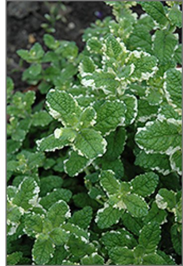
Variegated Pineapple Mint foliage

This is an herbaceous perennial herb with a spreading, ground-hugging habit of growth. Its medium texture blends into the garden, but can always be balanced by a couple of finer or coarser plants for an effective composition. This is a high maintenance plant that will require regular care and upkeep, and should be cut back in late fall in preparation for winter. It is a good choice for attracting butterflies to your yard. Gardeners should be aware of the following characteristic(s) that may warrant special consideration;