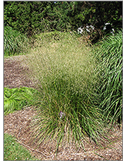
Bronzeschlier Tufted Hair Grass