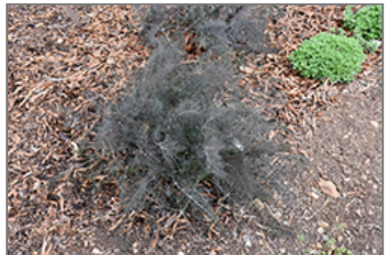
Bronze Fennel