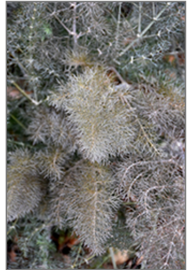
Bronze Fennel foliage

Bronze Fennel has masses of beautiful chartreuse flat-top flowers held atop the stems in mid summer, which are most effective when planted in groupings. The flowers are excellent for cutting. Its attractive fragrant ferny leaves emerge coppery-bronze in spring, turning bluish-green in colour with hints of coppery-bronze throughout the season.