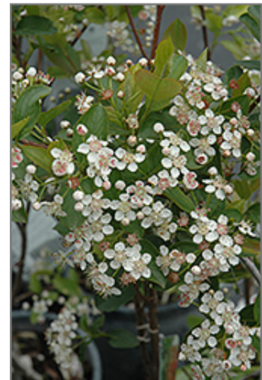
Viking Chokeberry flowers