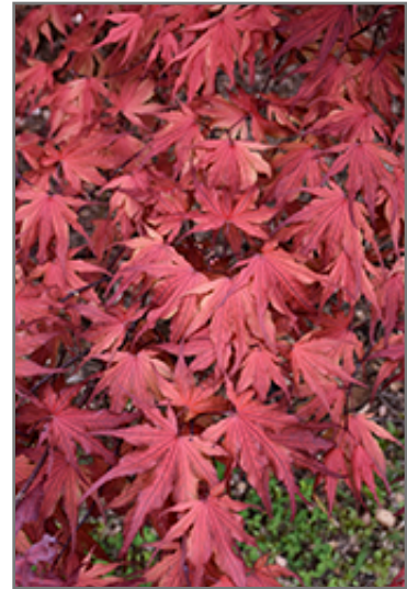
Purple Ghost Japanese Maple foliage