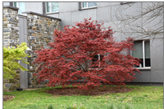
Purple Ghost Japanese Maple