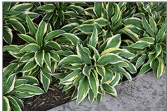
Wolverine Hosta