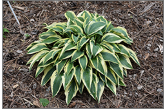
Wolverine Hosta

Wolverine Hosta will grow to be about 12 inches tall at maturity extending to 18 inches tall with the flowers, with a spread of 3 feet. When grown in masses or used as a bedding plant, individual plants should be spaced approximately 30 inches apart. Its foliage tends to remain dense right to the ground, not requiring facer plants in front. It grows at a medium rate, and under ideal conditions can be expected to live for approximately 10 years. As an herbaceous perennial, this plant will usually die back to the crown each winter, and will regrow from the base each spring. Be careful not to disturb the crown in late winter when it may not be readily seen!