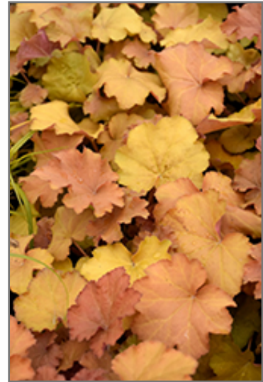
Caramel Coral Bells foliage

Caramel Coral Bells is recommended for the following landscape applications;