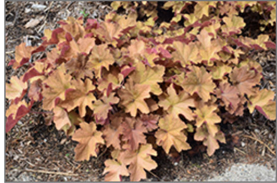
Caramel Coral Bells

Caramel Coral Bells will grow to be about 10 inches tall at maturity extending to 18 inches tall with the flowers, with a spread of 18 inches. When grown in masses or used as a bedding plant, individual plants should be spaced approximately 15 inches apart. Its foliage tends to remain low and dense right to the ground. It grows at a medium rate, and under ideal conditions can be expected to live for approximately 10 years. As an evergreen perennial, this plant will typically keep its form and foliage year-round.