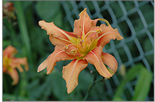
Kwanso Daylily flowers