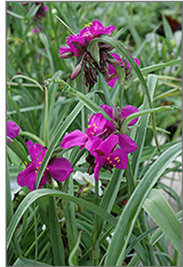
Red Grape Spiderwort flowers

Red Grape Spiderwort has masses of beautiful clusters of violet flowers at the ends of the stems from early to late summer, which are most effective when planted in groupings. Its grassy leaves remain grayish green in colour throughout the season.