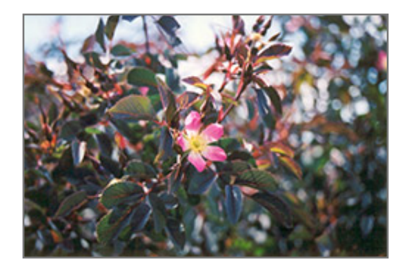
Red Leaf Rose flowers

This is a high maintenance shrub that will require regular care and upkeep, and is best pruned in late winter once the threat of extreme cold has passed. It is a good choice for attracting bees to your yard. Gardeners should be aware of the following characteristic(s) that may warrant special consideration;