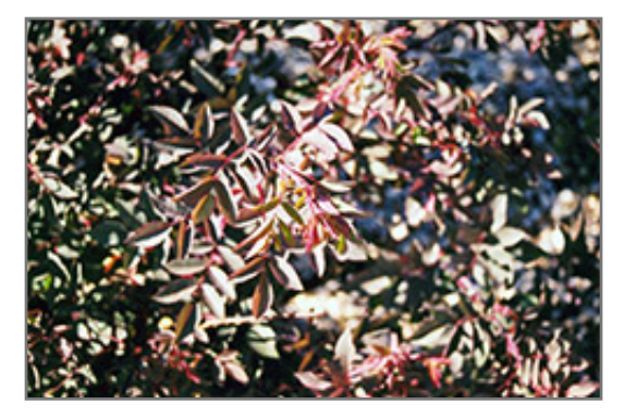
Red Leaf Rose foliage

Red Leaf Rose will grow to be about 4 feet tall at maturity, with a spread of 4 feet. It tends to be a little leggy, with a typical clearance of 1 foot from the ground. It grows at a medium rate, and under ideal conditions can be expected to live for approximately 30 years.