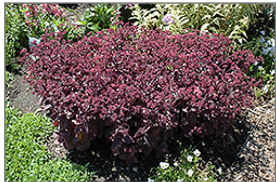
Xenox Stonecrop in bloom