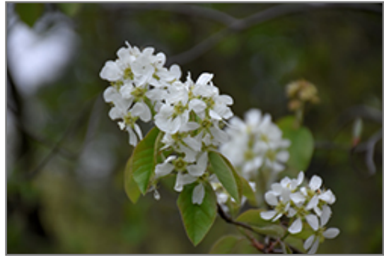
Saskatoon flowers

Saskatoon is a multi-stemmed deciduous shrub with an upright spreading habit of growth. Its relatively fine texture sets it apart from other landscape plants with less refined foliage.