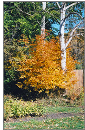
Saskatoon in fall