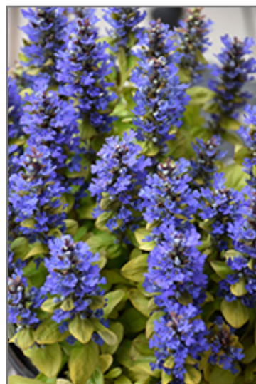
Feathered Friends Petite Parakeet Bugleweed flowers