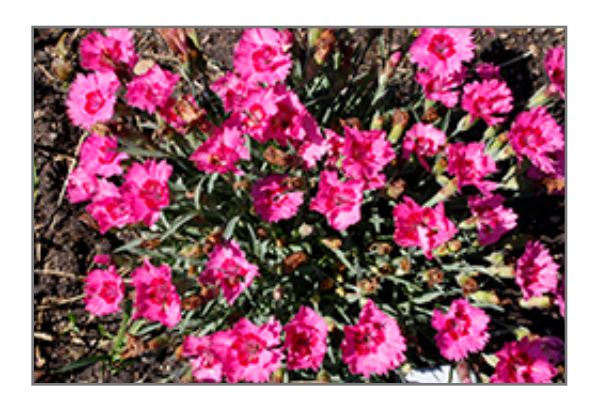
Paint The Town Fancy Pinks in bloom

This is a relatively low maintenance plant, and is best cleaned up in early spring before it resumes active growth for the season. It is a good choice for attracting bees and butterflies to your yard, but is not particularly attractive to deer who tend to leave it alone in favor of tastier treats. It has no significant negative characteristics.