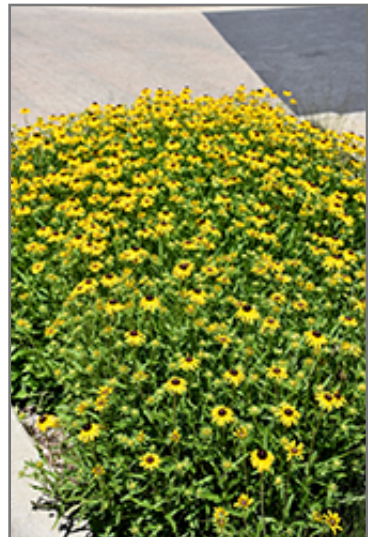
Viette's Little Suzy Coneflower in bloom