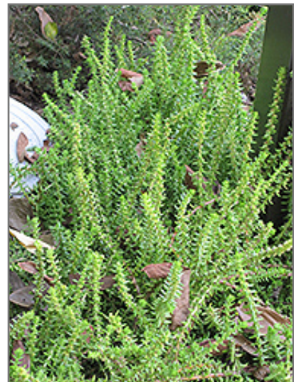
Watch Chain Crassula