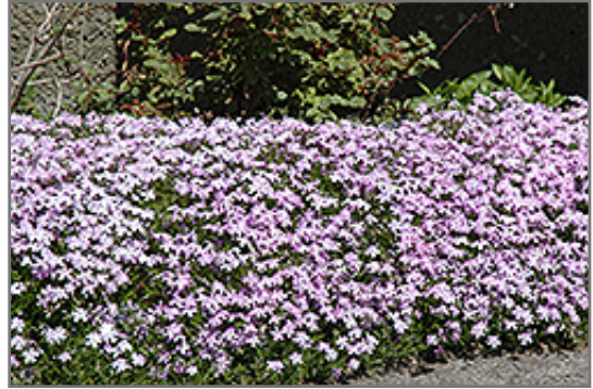
Emerald Blue Moss Phlox in bloom

This plant does best in full sun to partial shade. It prefers dry to average moisture levels with very well-drained soil, and will often die in standing water. It is considered to be drought-tolerant, and thus makes an ideal choice for a low-water garden or xeriscape application. It is not particular as to soil type, but has a definite preference for alkaline soils. It is highly tolerant of urban pollution and will even thrive in inner city environments. Consider covering it with a thick layer of mulch in winter to protect it in exposed locations or colder microclimates. This is a selection of a native North American species. It can be propagated by division; however, as a cultivated variety, be aware that it may be subject to certain restrictions or prohibitions on propagation.