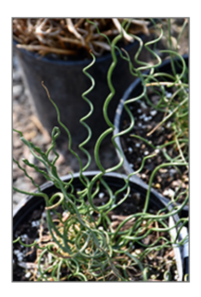
Big Twister Corkscrew Rush foliage