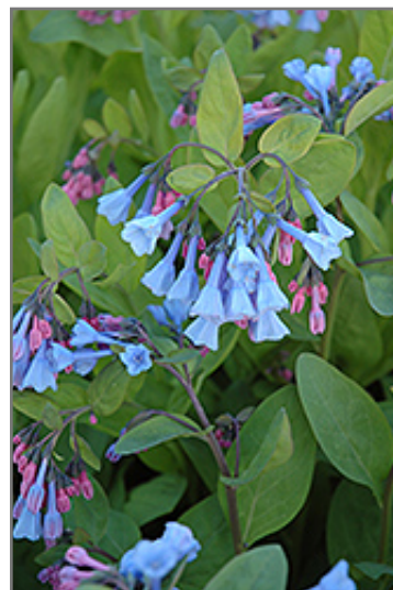
Virginia Bluebells flowers