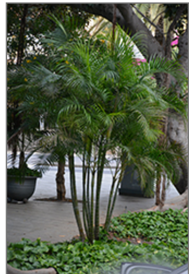
Areca Palm