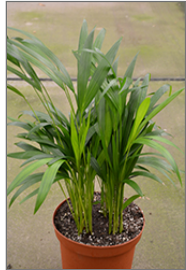
Areca Palm in full

When grown indoors, Areca Palm can be expected to grow to be about 12 feet tall at maturity, with a spread of 8 feet. It grows at a slow rate, and under ideal conditions can be expected to live for approximately 10 years. This houseplant will do well in a location that gets either direct or indirect sunlight, although it will usually require a more brightly-lit environment than what artificial indoor lighting alone can provide. It does best in average to evenly moist soil, but will not tolerate standing water. The surface of the soil shouldn't be allowed to dry out completely, and so you should expect to water this plant once and possibly even twice each week. Be aware that your particular watering schedule may vary depending on its location in the room, the pot size, plant size and other conditions; if in doubt, ask one of our experts in the store for advice. It is not particular as to soil pH, but grows best in rich soil. Contact the store for specific recommendations on pre-mixed potting soil for this plant.