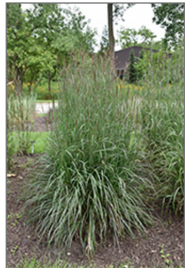
Blackhawks Bluestem in bloom