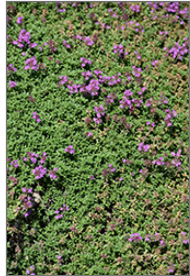
Creeping Thyme in bloom

Creeping Thyme is recommended for the following landscape applications;