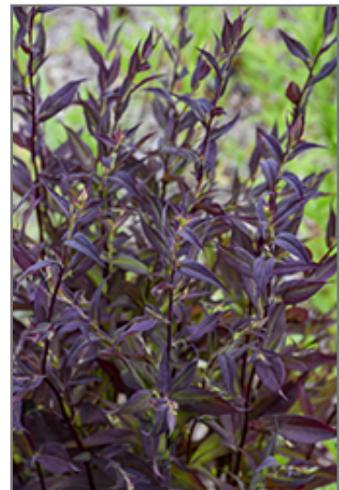
Lady In Black Calico Aster