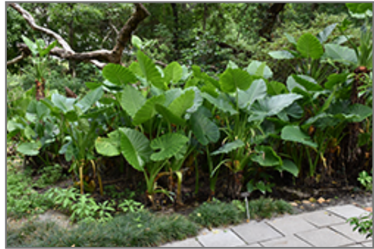
Calidora Elephant's Ear