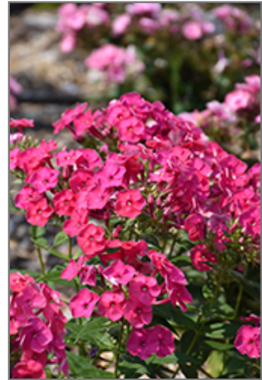
Ka-Pow Pink Garden Phlox flowers