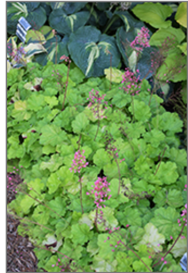
Primo Pretty Pistachio Coral Bells in bloom

This is a relatively low maintenance plant, and should be cut back in late fall in preparation for winter. It is a good choice for attracting butterflies and hummingbirds to your yard. It has no significant negative characteristics.