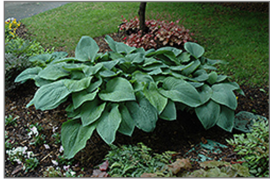
Blue Mammoth Hosta

Blue Mammoth Hosta is recommended for the following landscape applications;