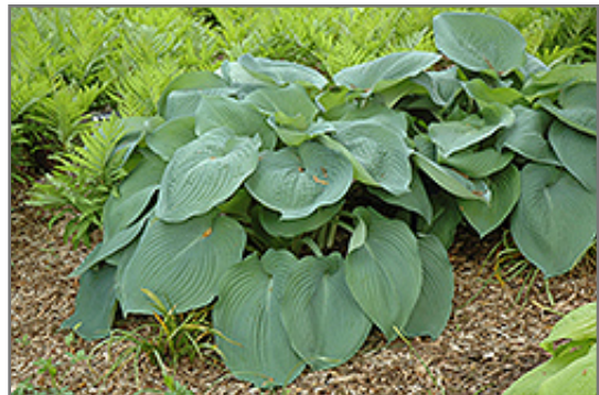
Blue Mammoth Hosta