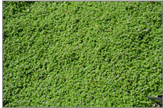
Mini Mint Ornamental Mint in bloom

Mini Mint Ornamental Mint is recommended for the following landscape applications;