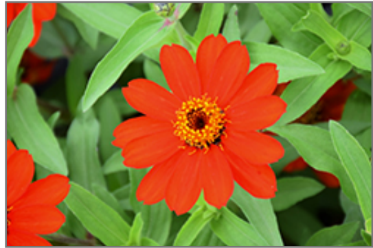
Zahara XL Fire Zinnia flowers

Zahara XL Fire Zinnia is recommended for the following landscape applications;