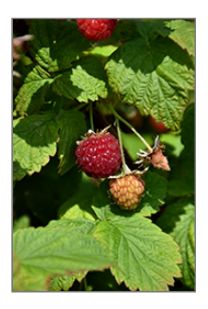
Festival Raspberry fruit

This is an open multi-stemmed deciduous shrub with an upright spreading habit of growth. Its relatively coarse texture can be used to stand it apart from other landscape plants with finer foliage. This is a high maintenance plant that will require regular care and upkeep. Each spring, cut back all dead and two-year old canes to the ground, leaving only last year's growth standing. It is a good choice for attracting birds to your yard. Gardeners should be aware of the following characteristic(s) that may warrant special consideration: