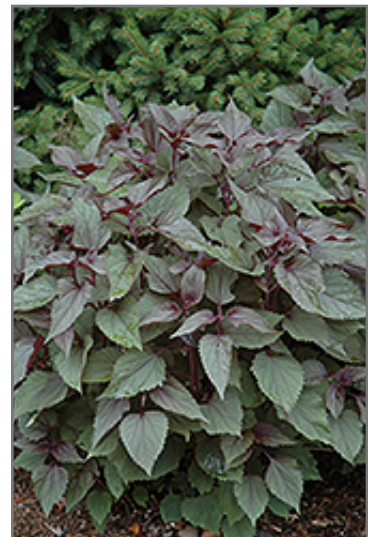
Chocolate Boneset foliage