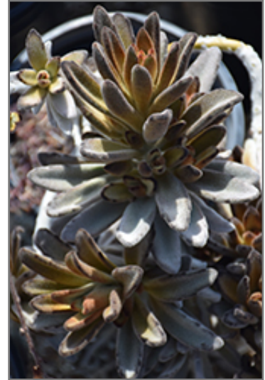
Chocolate Soldier Panda Plant

This is an herbaceous evergreen houseplant with a mounded form. This plant may benefit from an occasional pruning to look its best.