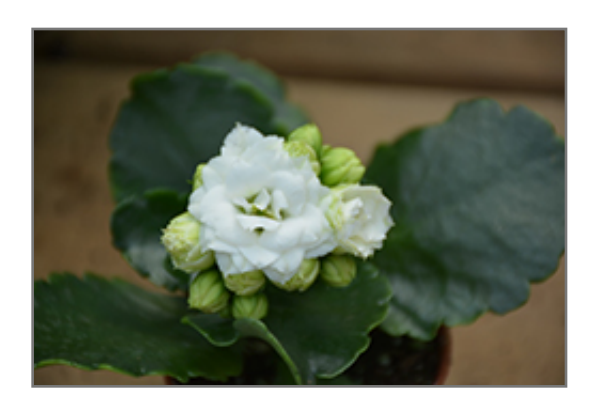
Calandiva White Kalanchoe flowers