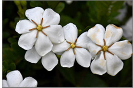
Kleim's Hardy Gardenia flowers