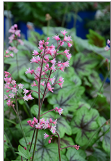
Pink Fizz Foamy Bells flowers