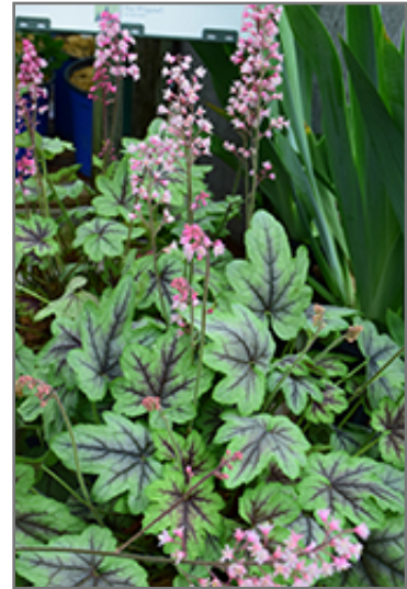
Pink Fizz Foamy Bells in bloom

Pink Fizz Foamy Bells is recommended for the following landscape applications;