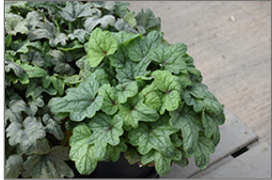
Pink Fizz Foamy Bells foliage

Pink Fizz Foamy Bells will grow to be about 8 inches tall at maturity extending to 12 inches tall with the flowers, with a spread of 18 inches. When grown in masses or used as a bedding plant, individual plants should be spaced approximately 15 inches apart. Its foliage tends to remain low and dense right to the ground. It grows at a medium rate, and under ideal conditions can be expected to live for approximately 10 years. As an evergreen perennial, this plant will typically keep its form and foliage year-round.