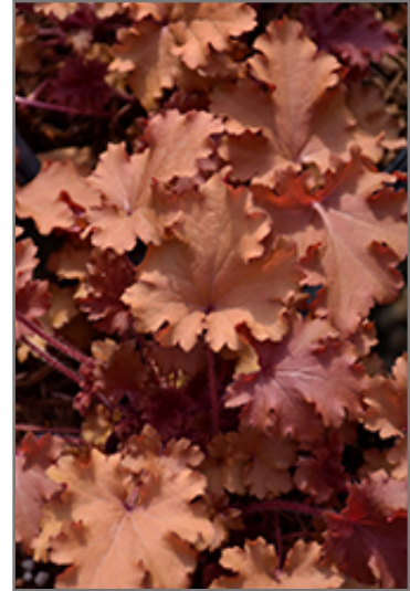
Peach Crisp Coral Bells foliage

Peach Crisp Coral Bells will grow to be about 14 inches tall at maturity extending to 20 inches tall with the flowers, with a spread of 18 inches. When grown in masses or used as a bedding plant, individual plants should be spaced approximately 15 inches apart. Its foliage tends to remain dense right to the ground, not requiring facer plants in front. It grows at a medium rate, and under ideal conditions can be expected to live for approximately 10 years. As an evergreen perennial, this plant will typically keep its form and foliage year-round.