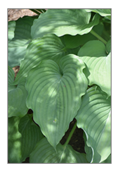
Komodo Dragon Hosta foliage