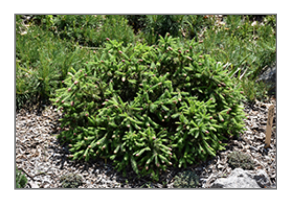
Pusch Spruce