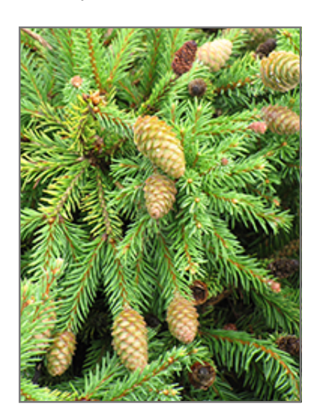
Pusch Spruce foliage