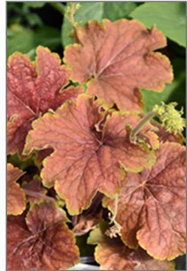
Delta Dawn Coral Bells foliage

Delta Dawn Coral Bells is recommended for the following landscape applications;