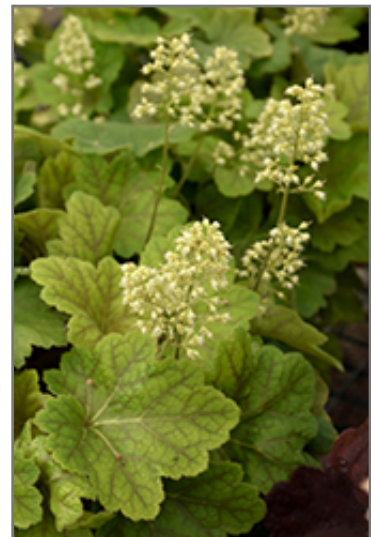
Delta Dawn Coral Bells flowers