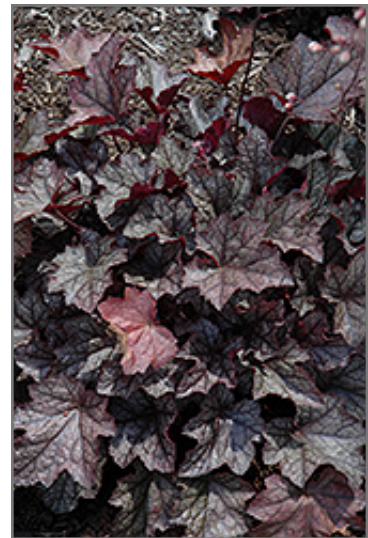
Carnival Plum Crazy Coral Bells foliage