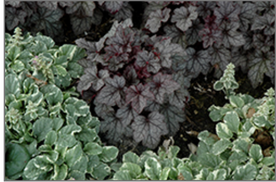
Carnival Plum Crazy Coral Bells

Carnival Plum Crazy Coral Bells is recommended for the following landscape applications;