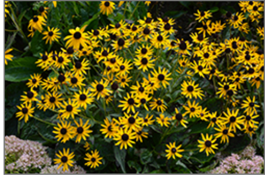
Little Goldstar Coneflower in bloom

This is a relatively low maintenance plant, and should be cut back in late fall in preparation for winter. It is a good choice for attracting butterflies to your yard, but is not particularly attractive to deer who tend to leave it alone in favor of tastier treats. It has no significant negative characteristics.