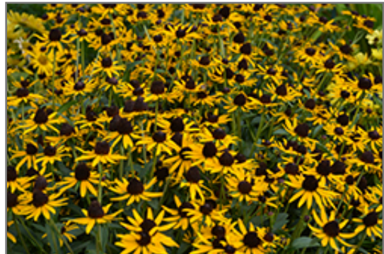
Little Goldstar Coneflower flowers