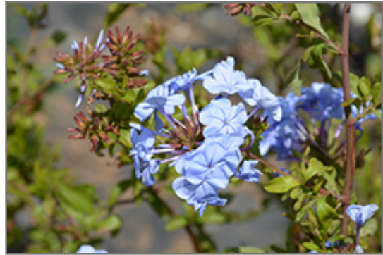
Imperial Blue Plumbago flowers

Imperial Blue Plumbago is recommended for the following landscape applications;