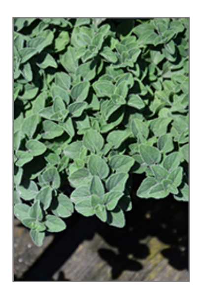
Hot And Spicy Oregano foliage

Aside from its primary use as an edible, Hot And Spicy Oregano is sutiable for the following landscape applications;