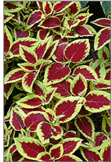
Fireball Coleus foliage

Fireball Coleus will grow to be about 18 inches tall at maturity, with a spread of 12 inches. When grown in masses or used as a bedding plant, individual plants should be spaced approximately 10 inches apart. Although it's not a true annual, this fast-growing plant can be expected to behave as an annual in our climate if left outdoors over the winter, usually needing replacement the following year. As such, gardeners should take into consideration that it will perform differently than it would in its native habitat.