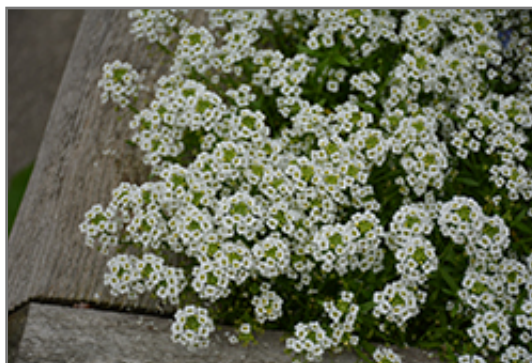
Snow Princess Alyssum flowers

Snow Princess Alyssum is recommended for the following landscape applications;