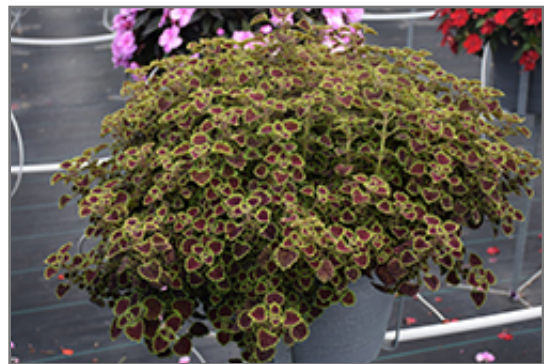
Burgundy Wedding Train Coleus